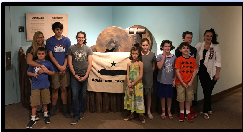
CRT at the Texas Experience on February 11, 2017